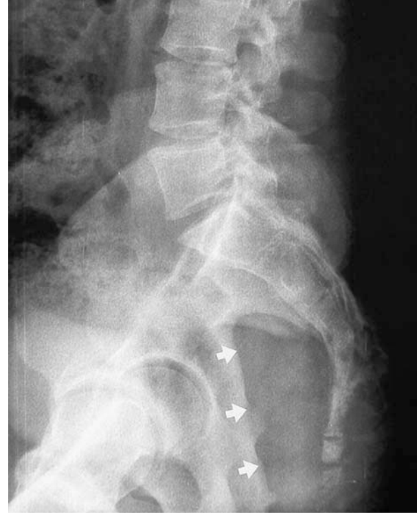
Figure 1. Simple x-ray of the lumbosacral spine. Lateral Projection. Lesion with a mass-effect in the posterior zone of the minor pelvis (arrows) and alterations in the sacro-coccyx bone texture with some lytic component.

extension associated with an anterior displacement of the rectum.