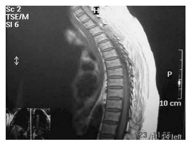
Figure 1. Magnetic resonance image. Sagital plane cut. Intramedullar hyperintense image in T1 in addition to medullar widening.

of headache and paresthesias on the face, sudden pain on the neck and back and, after some hours, a loss of muscle force on the legs, oppressive chest pain anesthesia from the T4 level downward, acute urinary retention, sphincter incontinence, abdominal distension, and, finally, paraplegia. Upon hospitalization she presented lymphopenia, 160/µL; platelets, 248 000/µL; INR, 1.16. A transverse myelitis was suspected for which she was treated with 6 g of intravenous methilprednisolone and 1 g of intravenous cyclophosphamide, and sent to our hospital. When examined we found generalized, burning pain, without sphincter control, with conserved superior mental functions, with hair loss, unaffected cranial nerves, a sensitive level at T4, with right upper extremity muscle strength of 2/5 proximal and 4/5 distal; on the upper left extremity, 4/5 proximal as well as distal; the rest was paraplegic. She had no Achillean reflex; she presented a left Babinski sign but it was indifferent on the left side.