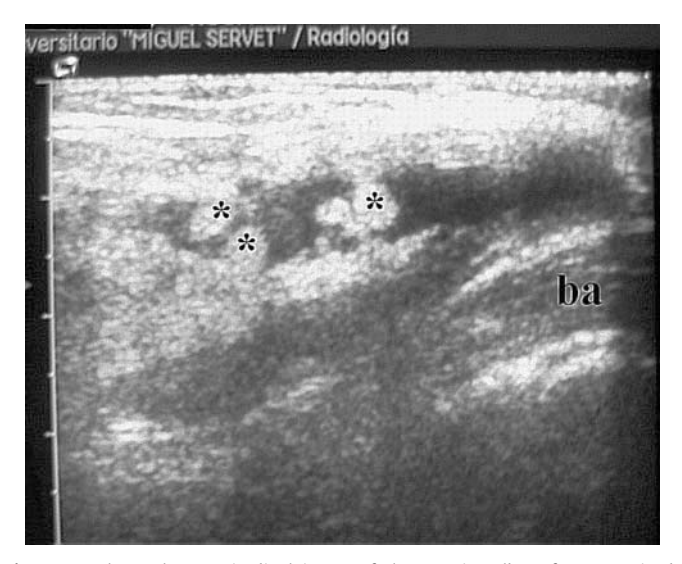
Figure 1. Echography. Longitudinal image of the anterior elbow fossa. A mixed echotexture mass with a anechoic liquid content and hyperechoic regions emanating from its walls as villous structures can be seen (*). The lesion is in the typical localization of the bicipitoradial bursa, over the insertion of the anterior brachialis muscle (ba).

The number of series that describe subjects with LA in any localization is very small<sup>1,8</sup> and most of the publications refer to sporadic cases. Localization of LA in the bicipitoradial bursa is very rare and only 5 cases of elbow LA can be found (Medline); in all cases. Its origin probably took place in the bicipitoradial bursa,<sup>4,9,12,14,15</sup> one