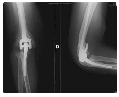
Figure 4. Anteroposterior and lateral x-ray of the right elbow (after 4 years since surgery). Prosthetic material can be seen in the right elbow.