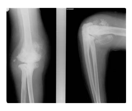
Figure 1. Anteroposterior and lateral x-ray of the right elbow. Joint destruction with erosions of the humerus as well as periarticular sclerosis, advanced osteochondromatosis, and joint impingement can be seen.

Faced with the presence of a destructive arthropathy of the elbow, without a history of infection, we suspected a neuropathic arthropathy. Therefore, we performed a cervical RM (Figure 3), which showed a centromedullar cystc cavity compatible with syringomyelia, and a Chiari type I malformation. The diagnosis was that of a neuropathic arthropathy due to syringomyelia. The patient underwent the collocation of a total elbow prosthesis and the liberation of the ulnar nerve, with a good progression after 4 years (Figure 4). With respect to the syringomyelia, a conservative approach was opted for.