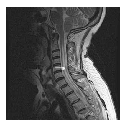
Figure 3. Cervical magnetic resonance in the sagital plane T2. The existence of a cystic, centromedular, and moderately dilated lesion compatible with hydrosyringomyelia can be seen (arrow) as well as a descent of the cerebella amygdale with a peak-type malformation belonging to Chiari type I.