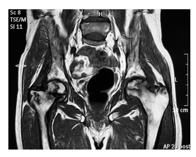
Fig. 1. MRI of the hips. On T1-weighted images there are hyperintense areas seen surrounded by a hypointense halo affecting both femoral necks and heads, corresponding to extensive bone infarcts at that level.

Although the incidence of ON in patients with HIV appears to be increased,<sup>5</sup> multifocal ON has been reported infrequently, mainly through isolated case reports.<sup>12,13</sup> In a Spanish series of 54 HIV-infected patients with associated ON, only 3 cases (5.7%) of multifocal<sup>8</sup> ON were described. ON occurs as a result of partial or