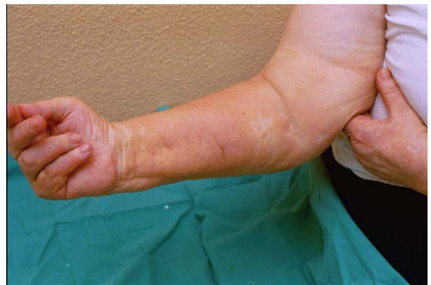
Fig. 2. Contracture of the fourth and fifth fingers of the right hand.

function testing. Two months later during routine visits the patient complained of the presence of papule-plaques involving the trunk and extremities accompanied by pain in the right hand together with flexion contracture of the 4th and 5th fingers of the right hand. The skin had a brownish appearance, and the arms and the legs were hyperpigmented (figs. 1 y 2). A punch biopsy of the skin showed a preserved epidermis with a fibrosed dermis with numerous collagen bundles and numerous fibroblast-like cells and absence of inflammatory infiltrates or plasma cells. Alcian blue stain demonstrates mucin deposits (fig. 3). A magnetic resonance (MR) of the arm showed an increased signal in the septum of subcutaneous cellular tissue with a "paved" appearance (fig. 4).