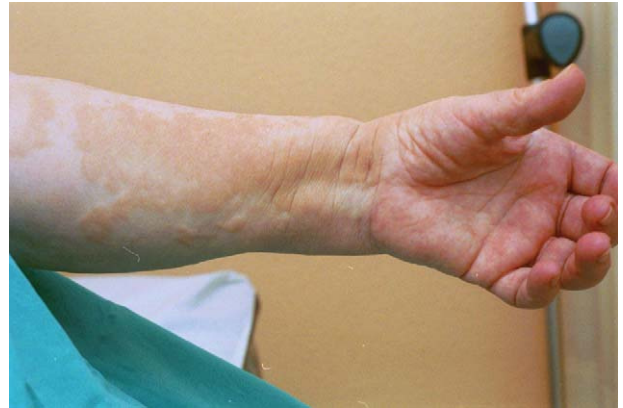
Fig. 1. Indurate papule-plaques with brownish hyperpigmentation of the arm.