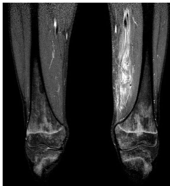
Fig. 2. The MRI study revealed the suspected pyomyositis.

When pyomyositis occurs in immunocompromised patients, as in the case reported here, we may have doubts about the convenience of surgical debridement because of fear of well known