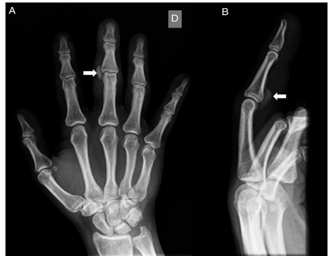
Fig. 1. Anteroposterior (Panel A) and lateral (Panel B) radiographs showing well-circumscribed calcification over the radial and volar aspect of the right third finger proximal interphalangeal joint (arrows).

Three weeks later, the patient experienced complete resolution of swelling and pain and exhibited full range of motion. Follow-up radiographs after two months showed complete disappearance of the calcification (Fig. 3).