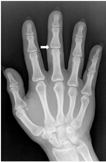
Fig. 3. Anteroposterior radiograph at 2 months follow-up demonstrating resolution of the calcified lesion (arrow).

patients are most commonly women with an average age of 45 years old (range 30–60), otherwise healthy. 3,4