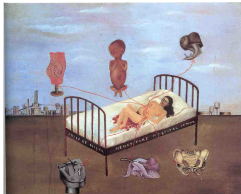
Fig. 3. “Henry Ford Hospital,” or “The flying bed”, oil on metal sheet, 30.5 cm × 38 cm; Dolores Olmedo Collection, Mexico City. D.R.© Fiduciario en el Fideicomiso relativo a los Museos Diego Rivera y Frida Kahlo. Av. 5 de Mayo No. 2, Col Centro, alc. Cuauhtémoc, c.p. 06000, Ciudad de México.