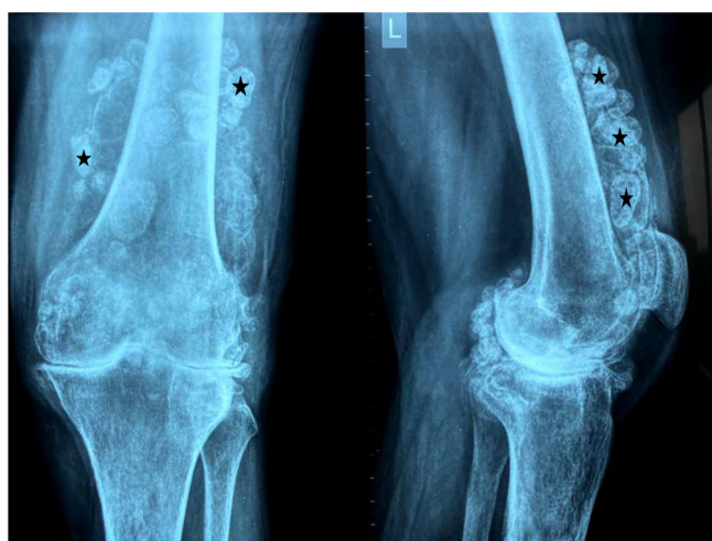
Fig. 1. Anteroposterior and lateral radiographs of knee. Multiple loose calcified bodies are seen within it (asterisks).

A 55-year-old lady presented in the outpatient clinic, with the complaints of mechanical knee pain of three-year duration. Radiographs (Fig. 1) of the knee were suggestive of multiple loose radio-opaque calcified bodies around the knee joint.