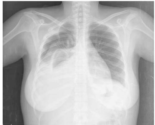
Figure 3. Posteroanterior chest x-ray after thoracocentesis that shows atelectasia and residual effusion.