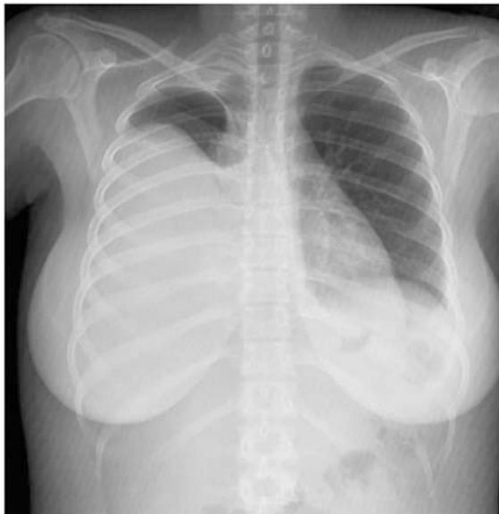
Figure 1. Posteroanterior chest x-ray showing a right pleural effusion.