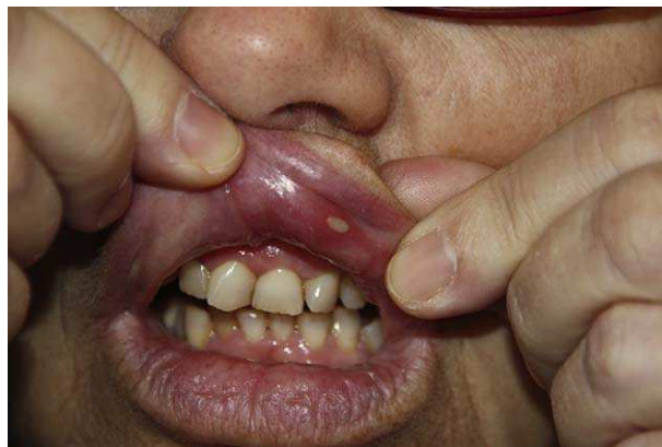
Fig. 1. Lesions start through an inflammatory foci in the form of erythematous painful macules.