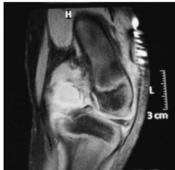
Fig. 1. MR of the left knee. The joint space shows occupation of the intercondylar notch and posterior recesses.

An ultrasound of the left knee showed moderate synovial effusion and high echogenicity in the posterior recess.