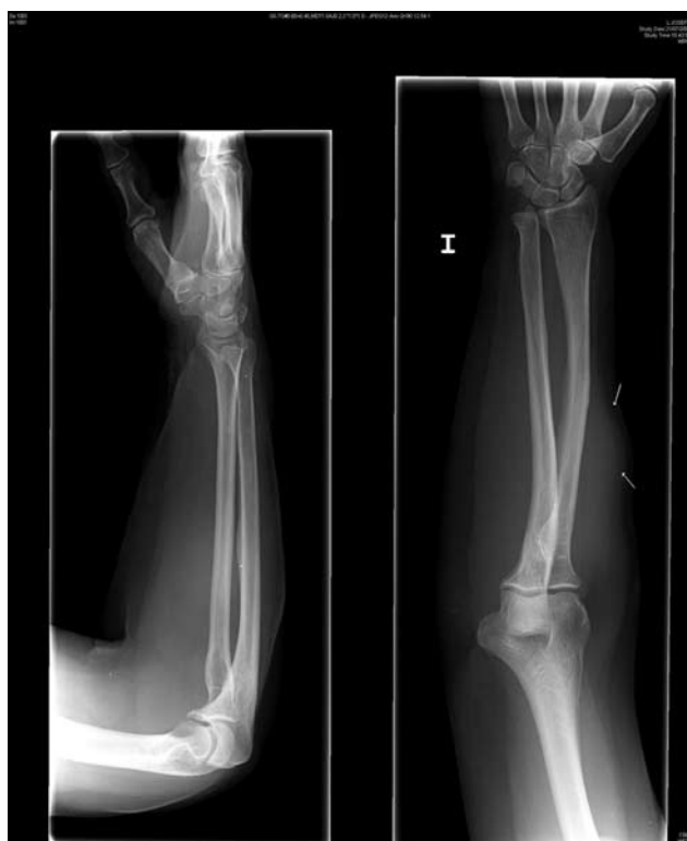
Figure 1. Left forearm Rx: Evidence of a dense mass in soft tissue, without evidence of underlying bone erosion.

A biopsy was performed which showed histopathological muscle metastases. This was surgically resected and did not require adjuvant treatment. At present there has been one subcutaneous preauricular recurrence, bilateral and abdominal, which is being treated with chemotherapy.