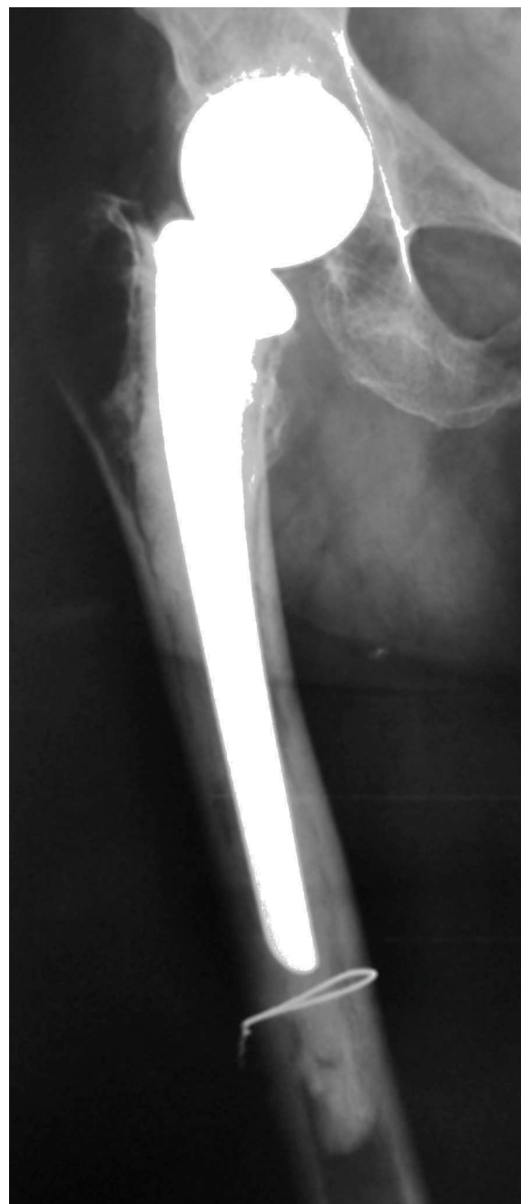
Fig. 1. X-ray of hip prosthesis.

Strontium ranelate, used to prevent osteoporotic fractures, 2 has been shown effective in improving prosthesis osteointegration in animals. 3,4 However, to date there are no studies assessing its effects in humans for this same purpose. Thus, the case presented here provides data suggesting that strontium ranelate can be beneficial for osteointegration of a hip prosthesis. The substantial improvement in symptoms just 2 months after treatment onset with normalization of bone scan at 6 months are promising and suggest its potential application in orthopedic surgery.