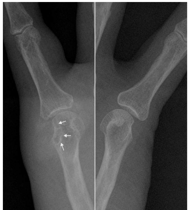
Fig. 2. X-rays centered on the fifth metacarpophalangeal joint of both hands that allows for the assessment of the bone erosion comparatively and shows the sclerotic margin (arrows) with soft tissue augmentation and high density in the medial aspect of the right metacarpal head. There was no involvement of the joint space.

At the onset of symptoms, the patient went to her family physician, who prescribed antibiotics, but after noting no improvement, decided to visit the emergency room. Upon interrogation she reported no known diseases or history of trauma, nor had fever. In the absence of history and because of the monoarticular involvement, the emergency room doctor decided to rule out an infectious origin, requesting an ultrasound guided arthrocentesis for microbiology analysis.