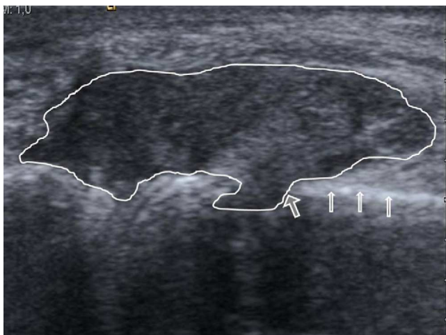
Fig. 1. Longitudinal section of the right fifth metacarpal head. A mass of soft tissue is seen in contact with the cortical bone (narrow arrows) and cortical erosion (thick arrow) with a soft-tissue mass in the core of the metacarpal bone.

b Servicio de Reumatología, Hospital General Universitario Gregorio Marañón, Madrid, Spain