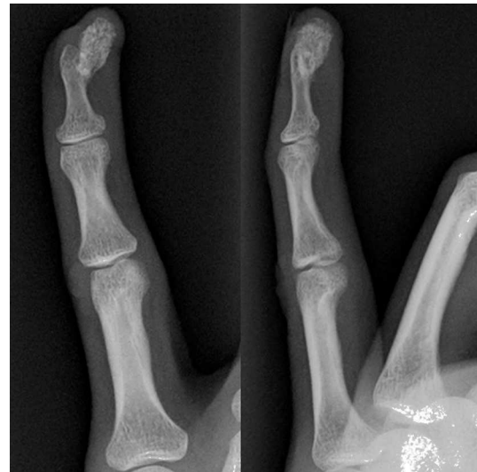
Fig. 1. Anteroposterior (A) and lateral (B) X-rays of the fifth finger of the left hand showing an ossified nodular lesion attached to the periosteum of the distal phalanx without cortical erosion.

FRPH is a rare benign entity characterized by a lush production of osteoblastic proliferative fibrous stroma in the periosteum of the fingers. 1 Its pathogenesis is unknown but is considered to correspond more to a reactive process than to a neoplasm, with a history of trauma being present in up to 50% of cases. 2 Although it was described in 1933 3 there still is confusion in the literature caused by different denominations, including paraostal fasciitis , ossifying fasciitis , fibro-osseous pseudotumor , pseudomalignant bone tumor of the soft tissue of the fingers and nodular fasciitis , with FRPH being the accepted term. 2,4 It is most frequently located in the proximal phalanx, followed by the middle phalanx, metacarpal joints and distal phalanx; it is rare in the first two fingers. It usually occurs in women during the second and third decades of life, and is clinically