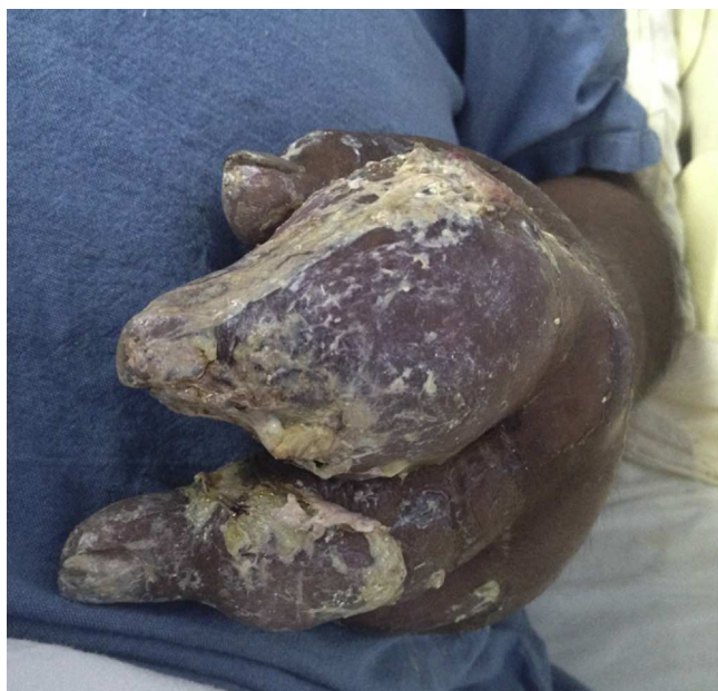
Fig. 1. Tophi with the presence of ulcerated skin and a white “clay-like” secretion.

The patient is a 46-year-old male with a history of hyperuricemia, traumatic amputation of the 4th and 5th fingers of the left