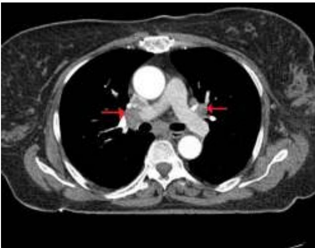
Fig. 1. Torax computed tomography showed bilateral hilar and mediastinal lymphadenopathies.