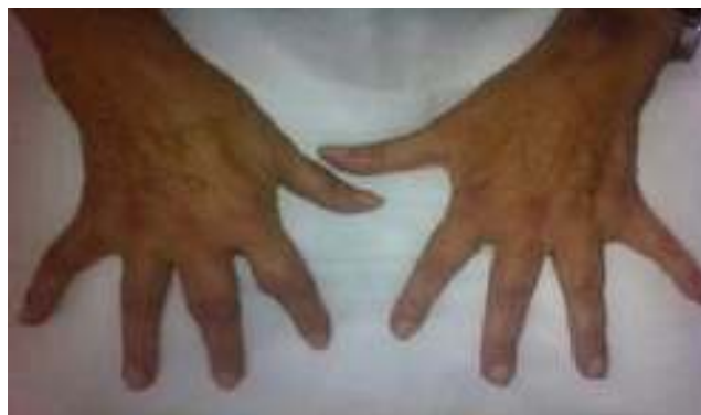
Fig. 1. Synovitis in several proximal metacarpophalangeal and interphalangeal joints.

factor and anti-cyclic citrullinated peptide, antinuclear, anti-U1-RNP, anti-Ro anti-cytoplasmic and anti-endomysium antibodies were all normal). The electromyographic study of upper and lower limbs detected no evidence of inflammatory myopathy. The imaging studies performed included: radiographies of elbows, hands (Fig. 2), pelvis, knees and feet. The only abnormal findings were calcium deposits in periarticular areas of the hands, together with osteopenia, with no evidence of erosion of any joint. High-resolution radiography and chest tomography revealed a reticular pattern compatible with interstitial pneumonia. Lung biopsy was performed, and the final diagnosis was usual fibrosing interstitial