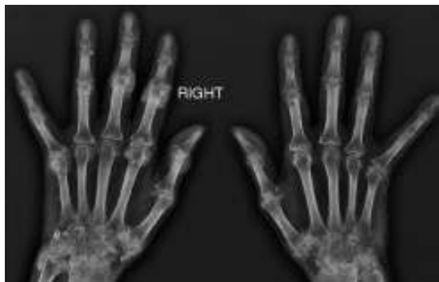
Fig. 2. Amorphous periarticular calcifications with polylobulated margins, without bone destruction, in the areas of different joints.

factor and anti-cyclic citrullinated peptide, antinuclear, anti-U1-RNP, anti-Ro anti-cytoplasmic and anti-endomysium antibodies were all normal). The electromyographic study of upper and lower limbs detected no evidence of inflammatory myopathy. The imaging studies performed included: radiographies of elbows, hands (Fig. 2), pelvis, knees and feet. The only abnormal findings were calcium deposits in periarticular areas of the hands, together with osteopenia, with no evidence of erosion of any joint. High-resolution radiography and chest tomography revealed a reticular pattern compatible with interstitial pneumonia. Lung biopsy was performed, and the final diagnosis was usual fibrosing interstitial