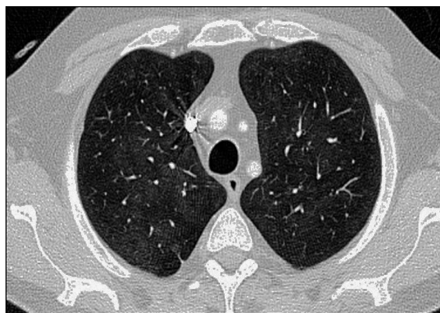
Fig. 2. Computer tomography showing a subtle increase in the ground glass density in upper thorax, predominantly in central and upper lobes, suggestive of an alveolar inflammatory process.

significant deterioration in his clinical status, with the development of fever and a dry cough, and was unable to complete the scheduled PFT. On the other hand, he had been taking amoxicillin/clavulanic acid for the preceding 2 days because of a dental abscess. A chest radiograph performed at that time (Fig. 1B) showed an increase in diffuse density in the region of the hilum and base of the lung. He was admitted to the hospital to complete the study and begin treatment with prednisone at 30 mg/day. The laboratory tests revealed a ferritin level of 4023 ng/mL (previously 1997 ng/mL), C-reactive protein at 17.7 mg/L, leukocytosis at 15,280 \times 10^3/\mu\text{L} , neutrophils at 12,360 \times 10^3/\mu\text{L} and lymphocytes at 1870 \times 10^3/\mu\text{L} , there being no other noteworthy findings. Bronchoalveolar lavage revealed an increase in the percentage of lymphocytes, with normal lymphocyte subsets and negative results for cytology and cultures for fungi, cytomegalovirus, herpes, influenza/parainfluenza and adenovirus, and negative staining of acid-alcohol fast bacilli. The PFT disclosed a restrictive change with a reduced diffusing capacity (48%), which was not corrected for at alveolar volume. During his hospital stay, the patient initially required oxygen therapy at 1.5 bpm and, subsequently, treatment with subcutaneous anakinra was introduced at 100 mg/day. Within a few days, he began to show progressive