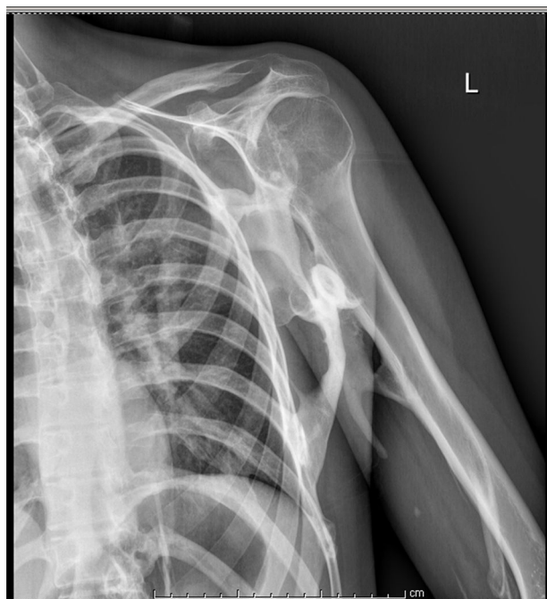
Fig. 3. Radiograph of shoulder showing a well-defined plaque of mature bone between the chest wall, humerus and scapula.

receptor/activin-like kinase 2 (AVCR1/ALK2). 2,3 Some authors have suggested that blocking the activity of the AVCR1/ALK2 receptor through the development of therapeutic agents that behave like signal transduction inhibitors that encode these proteins may be useful. 4 In this respect, we know that dorsomorphin, a small molecule produced by the zebrafish, inhibits BMP type I receptors (including ALK2—implicated in the etiology and pathogenesis of the disease—and other activin-like kinases like ALK3 and ALK6) 5 ; however, given the lack of specificity of this molecule, further studies are needed in this line of research, as well as the development of in vivo models to determine the potential efficacy of this molecule in the prevention of the flares of ossification that occur in this serious disease.