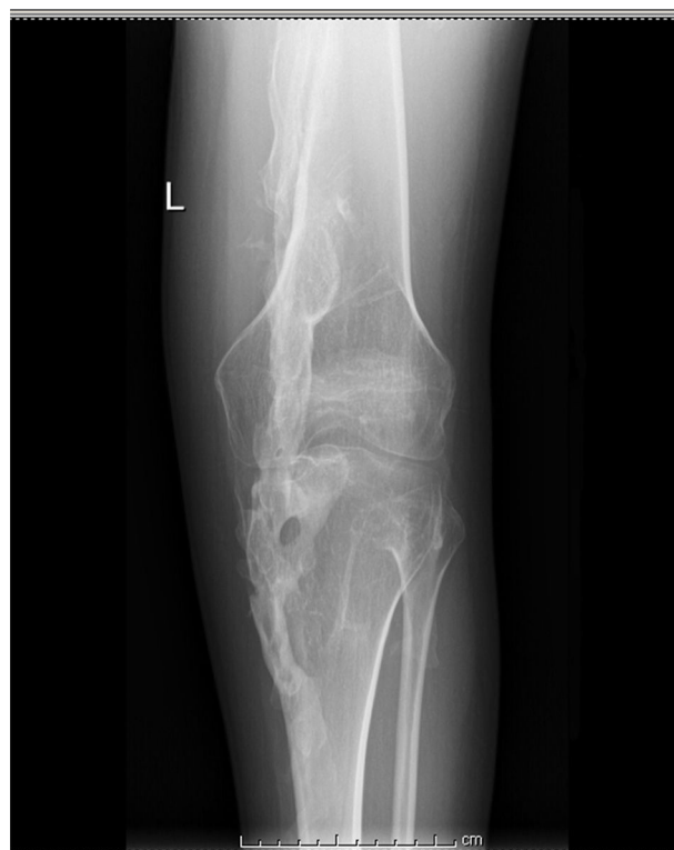
Fig. 1. Radiograph of left knee showing ankylosis secondary to bone bridges.

Fibrodysplasia ossificans progressiva is a rare disease of unknown origin that is characterized by a progressive heterotopic ossification of the muscles and other structures in which connective tissue is abundant. 1 In recent years, there has been an advance in our knowledge of the etiological and pathogenic mechanisms of this disorder, which implicates the receptor of bone morphogenetic protein (BMP), the so-called activin A type I