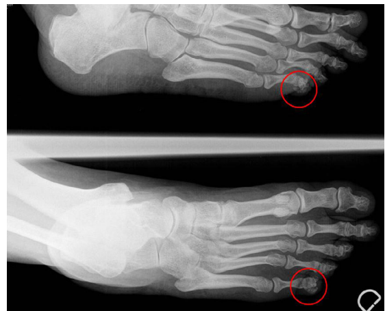
Fig. 1. Plain radiography shows a small calcification in a lateral region of the distal phalanx of the fifth toe.

The differential diagnosis should include a variety of neoplastic and nonneoplastic processes of the distal extremities accompanied by calcifications: gout, pseudogout, calcifying aponeurotic