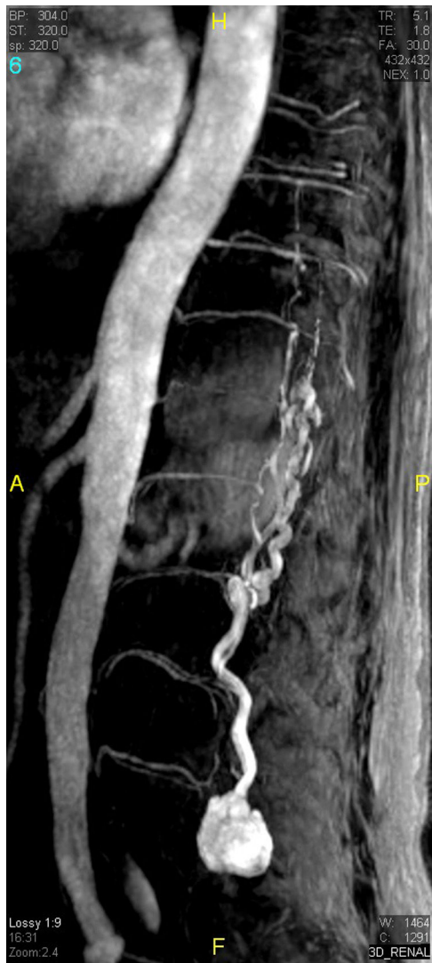
Fig. 3. Contrast-enhanced magnetic resonance angiographic image. Sagittal plane with maximum intensity projection reconstruction. The image shows the mass, as well as the dilated vascular structures. Because of the static nature of the examination, the view does not show the origin of the blood supply.