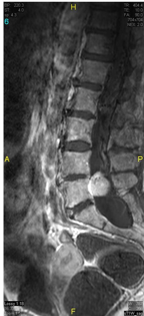
Fig. 2. Contrast-enhanced sagittal T1-weighted turbo spin-echo image. Intense enhancement of the intradural mass.

decision was made to embolize the lesion via right pedicle of L4, which resulted in its marked devascularization. After the procedure, the patient remained asymptomatic until the clinical signs reappeared 3 months later. Magnetic resonance imaging showed that the lesion continued to progress, and the decision was made to reoperate. This procedure achieved very limited resection due to adherence of the tumor and scar tissue to the L5 and S1 nerve roots, making it necessary to interrupt the intervention due to the risk of significant neurological sequelae.