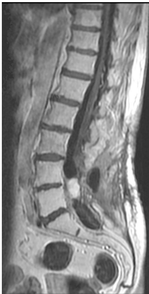
Fig. 5. Contrast-enhanced sagittal T1-weighted turbo spin-echo image. Reduction of the intradural mass and absence of the dilated vascular structures.

patients with multiple tumors and those of difficult surgical access and in postoperative recurrence.