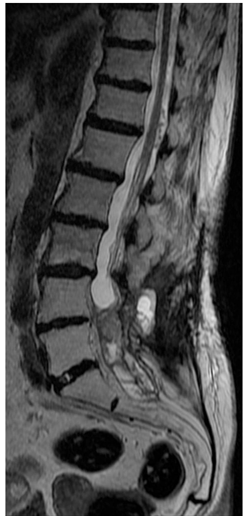
Fig. 4. Sagittal T2-weighted turbo spin-echo magnetic resonance image. Reduction of the intradural mass and absence of the dilated vascular structures.