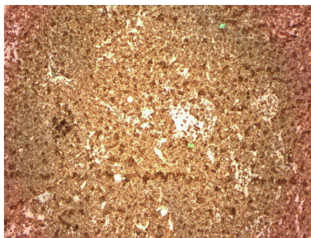
Fig. 2. Biopsy of low grade B-cell lymphoma of MALT type of the parotid gland. CD 20 stain showing sheets of B cells in case 2.

A 16-year-old boy presented with intermittent painless cervical lymphadenopathy and bilateral parotid swelling for more than 5 years. Neck CT demonstrated enlargement of the parotids. A fine needle aspiration showed a benign lymphoid tissue with no evidence of malignancy. Laboratory data showed an increased ESR (122 mm/h). Histopathology analysis showed infiltration of the salivary gland by a lymphocytic proliferation forming confluent nodular masses and follicular hyperplasia of the attached lymph nodes, indicative of a lymphoid malignancy (Fig. 1). Immunohistochemical stains demonstrated sheets of CD20+ B cells that were negative for CD5, CD43, and cyclin-D1, confirming B-cell clonal proliferation (Fig. 2). CD10 and BCL-6 stains highlighted germinal centers which were negative for BCL-2. A Ki-67 stain showed numerous positive cells within and between germinal centers (20–30% cells). Parotidectomy and radiotherapy was performed.