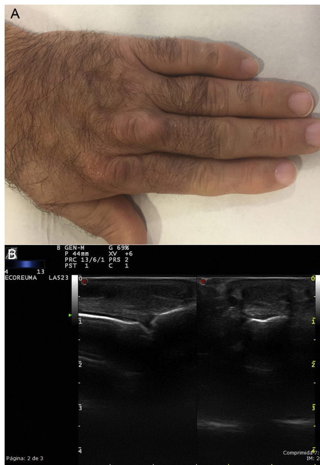
Fig. 2. A. Tendon xanthomas on the extensor tendons of the fingers. B. Ultrasound of the same patient, extensor tendon of the third finger: a thickened tendon can be seen on a transversal and longitudinal slice, of heterogeneous echotexture.

Privacy rights and informed consent. The authors declare that no patients' data appear in this article