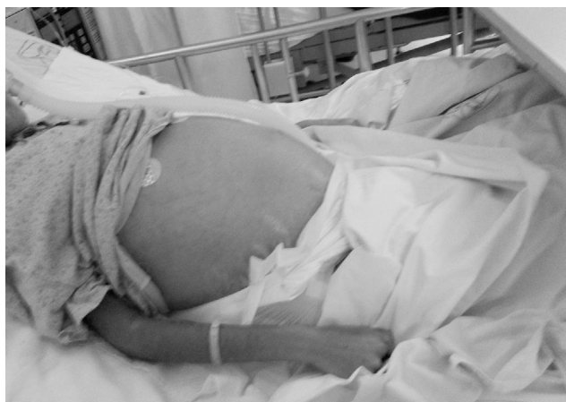
Fig. 1. Massive ascites in our patient.