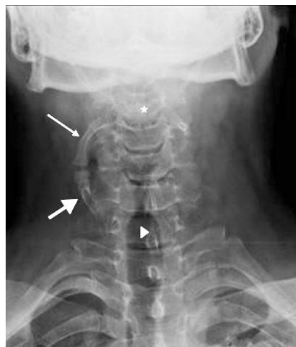
Fig. 1. Proximal cervical rib (thin arrow) originating in vertebral body C3 (star) in a caudal direction and articulating with another distal supernumerary rib (thick arrow) originating and ascending from vertebral body C7 (arrow tip).

Cervical ribs are prolongations of the transverse process of the seventh cervical vertebra beyond the transverse process of the first thoracic rib. Their incidence is different in different countries, 1–7 although it is estimated at around between .2% and 8%, and is more common in women. 3,5,7 They can be unilateral or bilateral (the latter comprise 50%–80%), with poor right predominance when they