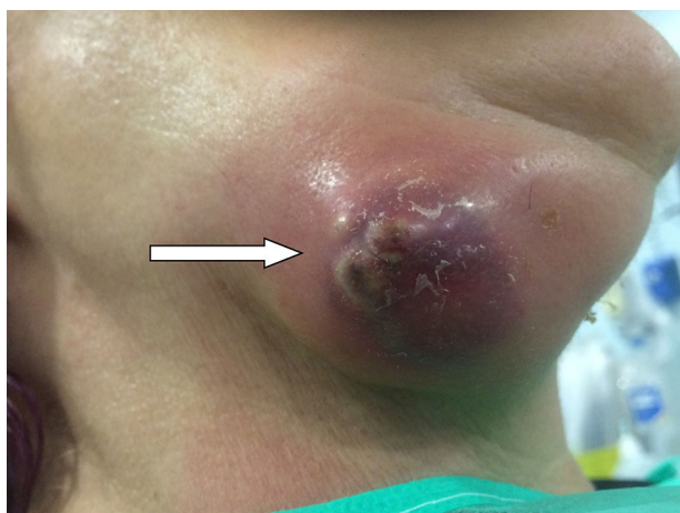
Fig. 1. Massive right submandibular abscess (white arrow).