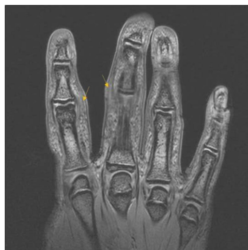
Fig. 3. MRI of right hand, showing an increase in soft tissue with altered signal due to oedema of the second, third and fourth fingers (arrows).