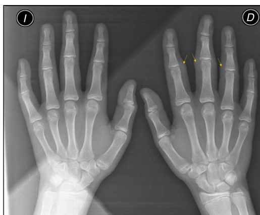
Fig. 2. Radiographic image with increase in soft tissues on the second, third, and fourth IPJ of the right hand, with no signs of associated joint or bone involvement (arrows).