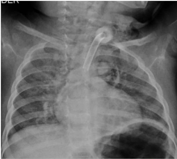
Fig. 1. Plain chest X-ray with evidence of diffuse micronodular bilateral perihilar infiltrate.

whereas in older children, involvement of the lungs, lymph nodes and eyes predominates. 6 Several treatment modalities are reported for laryngeal sarcoidosis, including systemic corticosteroids, intralesional corticosteroid injection, and surgical removal. 7