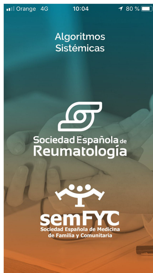
Fig. 1. Cover of the app.

The platforms detect the application within the 5 first rankings from searches with “Semfyc”, “Rheumatology”, “Referral”, “Autoimmune”, “Algorithm disease” or “family medicine”. The app is regularly updated (currently in its 7th version) correcting errors communicated by its users (especially at the beginning) and