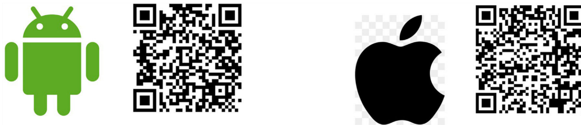
Fig. 2. QR download codes.

to date. It may meet the needs arising in daily practice, resolving doubts the GP may have on a day-to-day basis.