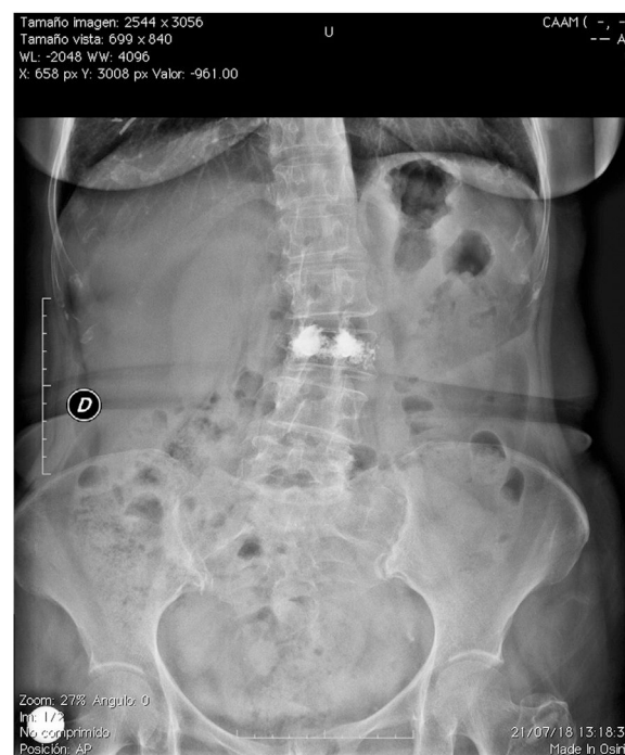
Fig. 1. Anterior–posterior lumbar spine radiograph.