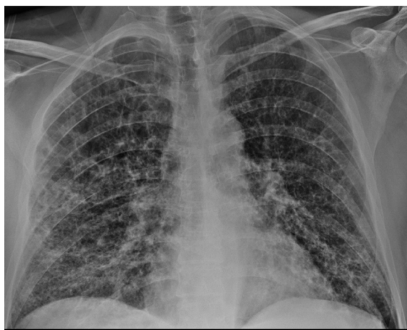
Fig. 1. Chest x-ray on admission bilateral alveolar infiltrations with a ground glass pattern.

In the case of our patient, treatment with tocilizumab did not provide clinical or analytical improvement, while the use of anakinra allowed clear improvement at 48 h. Although a possible benefit due to the late effect of tocilizumab cannot be ruled out. Although a single dose of anakinra was administered to our patient, there are studies such as that of Monteagudo et al., which show the efficacy of this drug in continuous infusion at doses greater than 2400 mg/day for the treatment of macrophage activation syndrome (MAS). 7