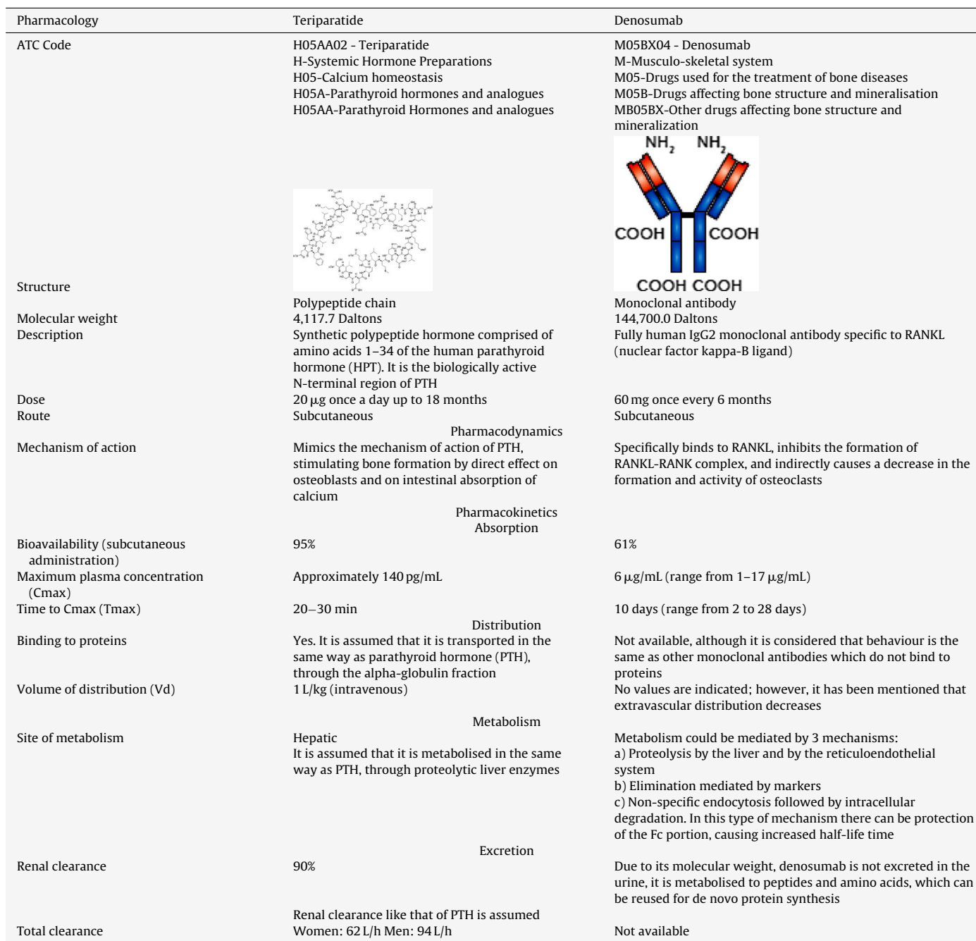
Table 1 Main pharmacological differences between teriparatide and denosumab.