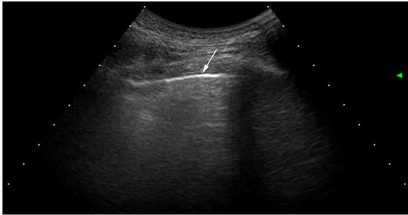
Fig. 1. Pulmonary US imaging in a healthy subject. Note that the pleura is a lineal and regular hyperechoic band (arrow). There are no B lines B.