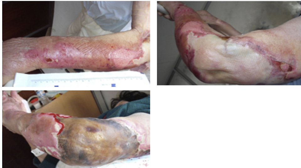
Figure 1. Evolution of skin lesions at first five days of internment: areas of extensive skin detachment in the context of rupture of blisters and severe exudation and necrotic areas.

metacarpophalangeal, interphalangeal and wrist joints. Left upper limb presented diffusely oedematous with a slight erythematous rash and increased temperature. Laboratory tests were as follow: hemoglobin 12.3 g/dl; white blood cell (WBC) count 11.8 \times 10^9/l