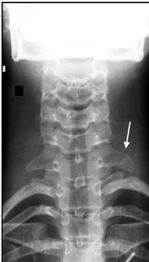
Fig. 3. X-ray of the cervical spine with an abnormally elongated C7 left transverse process (white arrow).

Further examination with magnetic resonance imaging (MRI) excluded any discoradicular conflict at the level of C8 and T1 but identified small excess of fat and edema in the form of a “teardrop” surrounding C8 and T1 suggesting compression of these nerves at the thoracic outlet level (Fig. 2). A standard radiography of the cervical spine clearly showed an abnormally elongated left C7 transverse process (Fig. 3). A diagnosis of TN-TOS was concluded.