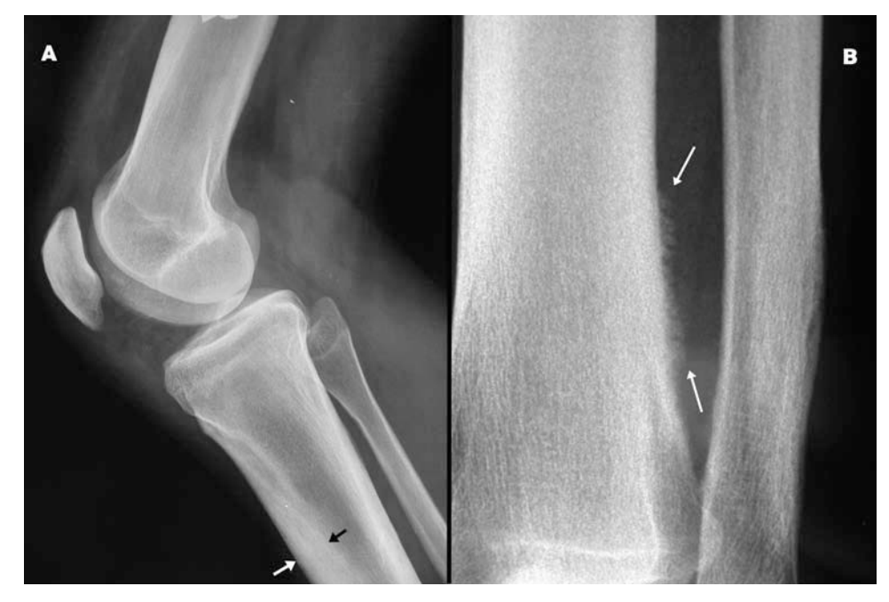
Figure 1. A) Lateral x-ray of the right knee in which cortical hyperostosis of the tibia and fibula can be seen (arrows). B) Detail of the speculated periostosis on the right tibia (arrows).