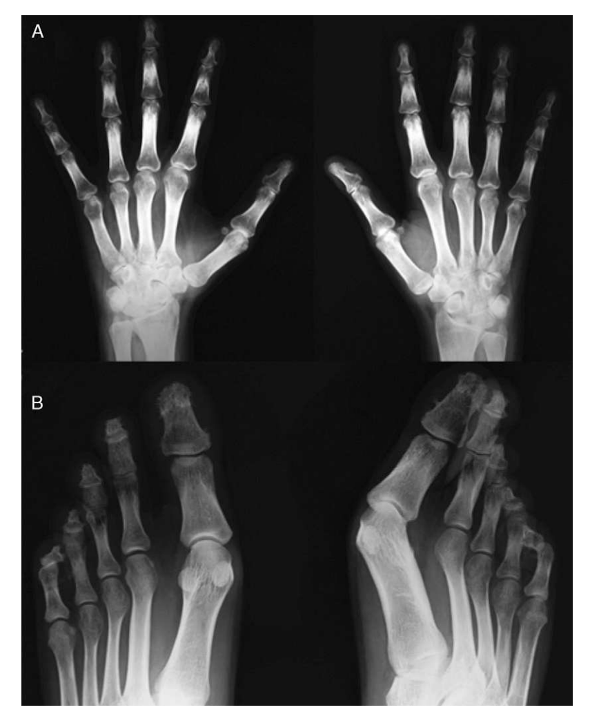
Fig. 1. Hand X-ray (A) in which there is a periosteal reaction on the radius. There is distal widening with hypertrophic changes and areas of osteolysis, with a good example on the right fourth finger. Juxtaarticular demineralization. Feet X-ray (B) observing marked destruction of the distal phalanges, some with flattened morphology and distal hypertrophy with bone proliferation. There is marked deformity of the fingers.