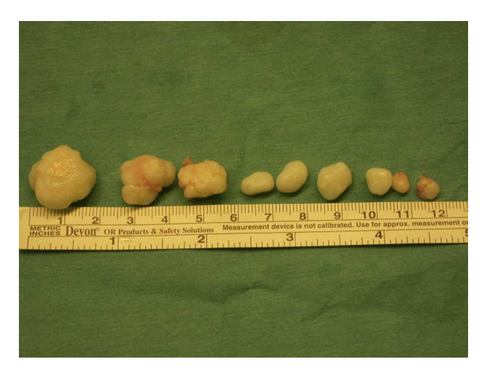
Fig. 2. Removal of 9 loose bodies. Note the comparative size.