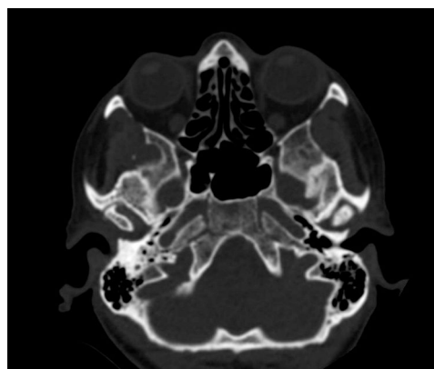
Fig. 1. CT scan showing condylar deformity with osteosclerosis, flattening and osteophytes.

Despite not verifying jawbone involvement, and without being able to rule out other causes (osteoarthritis, arthritis), due to the absence of previous events, this case was suggestive of an isolated involvement of the TMJ provoked by continuous stress to which the articular condyles are subjected as a consequence of mastication, leading to degenerative phenomena with episodes of bone remodelling. However, confirmation of this