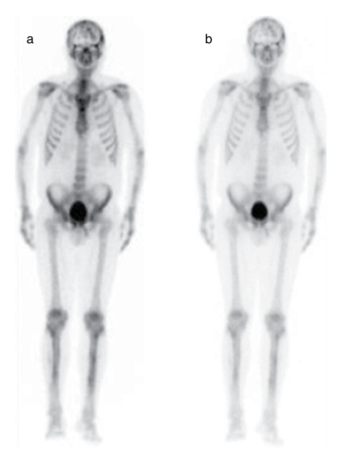
Fig. 3. Scintigraphy at presentation (a) and at 6-month (b) blood pool phase.

admitted to the Infectious Diseases service by severe pain in the shins and forearms with five months of evolution. Pain worse at night and was accompanied by daily episodes of throbbing holocraneal headache, asthenia, loss of appetite and weight loss. He was under maximum dose of tramadol 37.5 mg+acetaminophen 325 mg without any improvement. No other relevant epidemiological data.