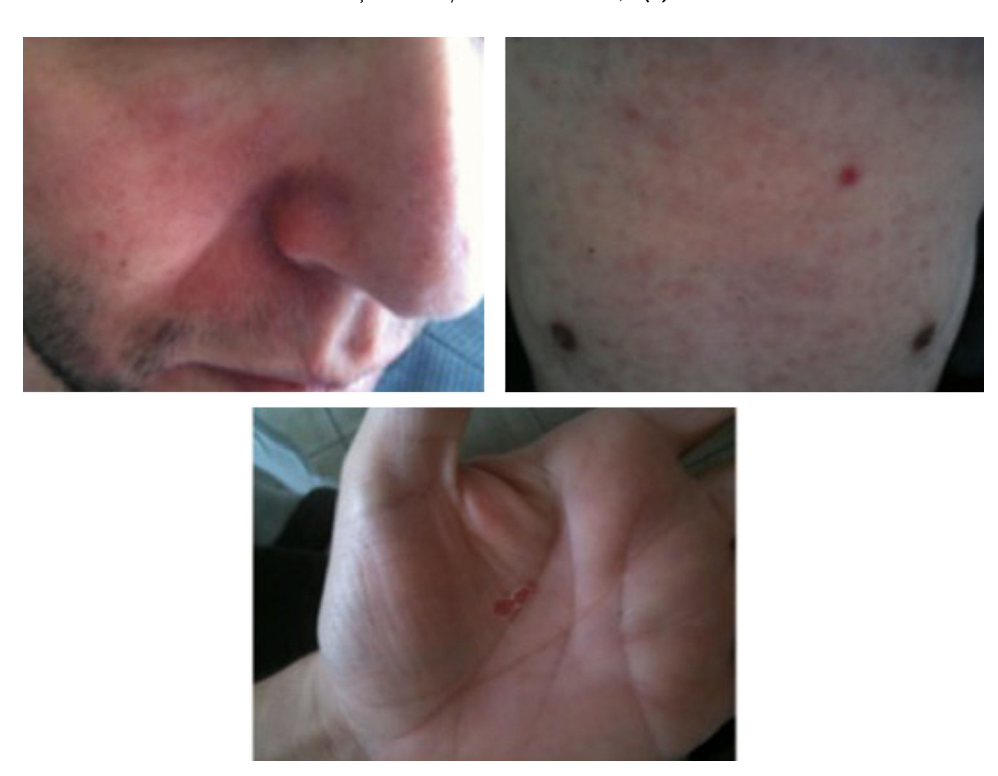
Fig. 1. Generalized macular and maculopapular skin rash.