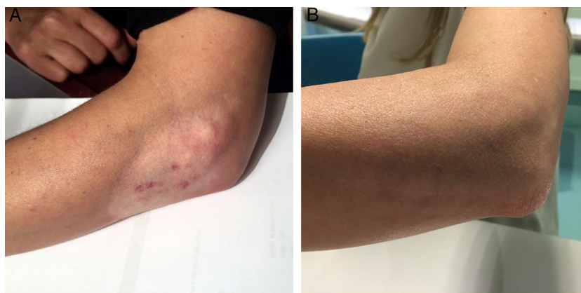
Fig. 1. (A) Skin hypopigmentation and subcutaneous fat atrophy in the right elbow of the patient after corticosteroid injections; (B) elbow surface 24 months after fat graft.