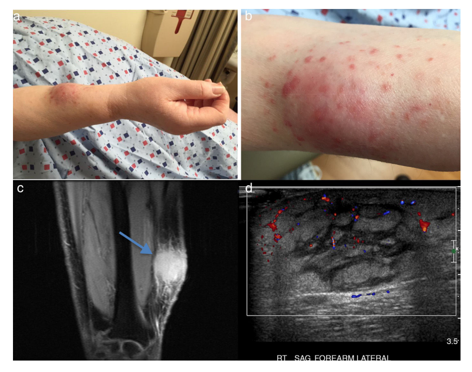
Fig. 1. (a) Enlarged soft tissue tumor in the right forearm with small papules, (b) detailed view of the same lesion (c) (a) MRI T1 FS coronal view, showing enhancing lesion without a discrete mass in the right forearm with edema, ulceration along the superficial fascia as well as along the subcutaneous fat with skin thickening (blue arrow). (d) Ultrasonography of the dorsal forearm showing increased soft tissues with thickening of the fat pad and enlarged septa, with slight power Doppler signal in peripheral areas.