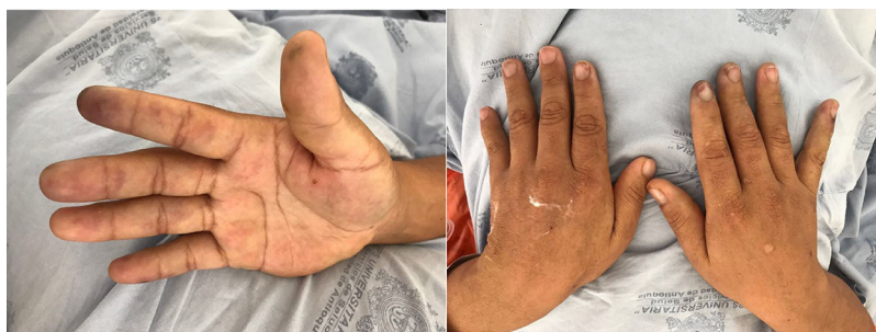
Figure 1. Ischemic lesions in the fleshy parts of the fingers, secondary to cryoglobulinemic vasculitis.

Respecting the kidney involvement, the patient had focal and segmentary glomerulosclerosis, a rare form of involvement given that the most common renal involvement described in cryoglobulinemic vasculitis, whether or not it is secondary to HCV infection, is membranoproliferative glomerulonephritis. 4 It has mainly been observed in patients with mixed type II cryoglobulinemia in which the monoclonal component is IgM kappa, and its most frequent clinical manifestation is isolated proteinuria or haematuria. 5 In spite of the above considerations, other forms of renal histological