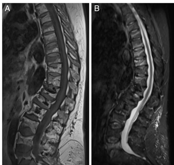
Fig. 2. MR images of case 9 taken 9 months after discontinuation of Denosumab, in T1 (A) and STIR sequences (B).

to undergo a dental procedure do not recommend discontinuing treatment with bisphosphonates or DMab. If there are risk factors for maxillary osteonecrosis and the surgical procedure will be extensive, the possibility of discontinuation is only considered in the case of the bisphosphonates. 13