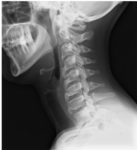
Fig. 1. lateral cervical spine X-RAY shows ossification along the anterior aspect of the vertebral bodies from C3 to C7, preservation of disc height in the involved levels and the absence of bony ankylosis of facet joints.

enthesal symptoms. No psoriasis, uveitis or inflammatory bowel disease in her past medical history. She was healthy and fit doing regular pilates and running. She worked as a waitress. She used ibuprofen 600 mg every eight hours and diazepam 5 mg at flares.