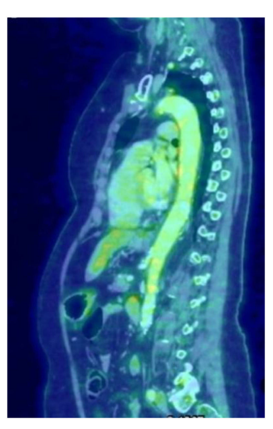
Fig. 1. PET: increased metabolic activity of the aorta artery along its entire length.

or angiotomography. The use of FDG-PET has facilitated evaluation of large vessel inflammation, with a high degree of sensitivity for detecting extracranial forms. It is the method of choice in patients