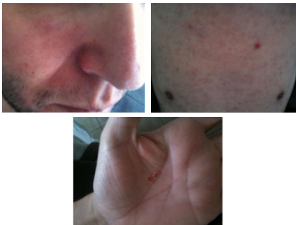
Fig. 1. Generalized macular and maculopapular skin rash.