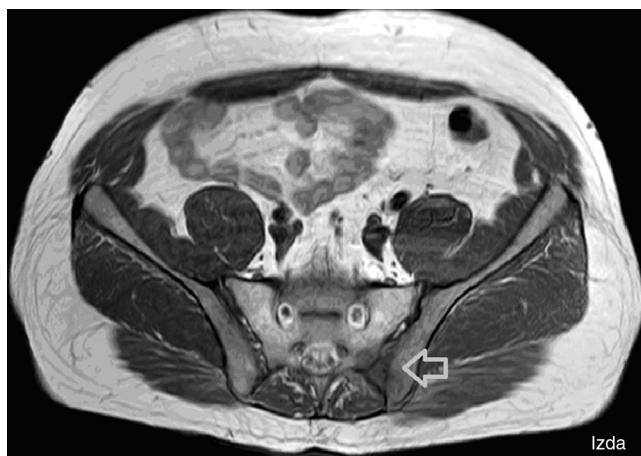
Fig. 1. Abdominopelvic computed tomography.